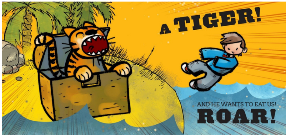
It's a Tiger by David LaRoche (Chronicle Books, 2012)

Need some inspiration? Here are some examples of signs from our previous StoryWalks. Although they are part of a story, they can also be enjoyed on their own. You can provide some details and then leave the rest for your readers to imagine! We are looking for original ideas and large, colorful illustrations.